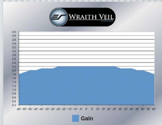
Choose either CineWhite Front Projection or Wraith Veil Rear Projection Material