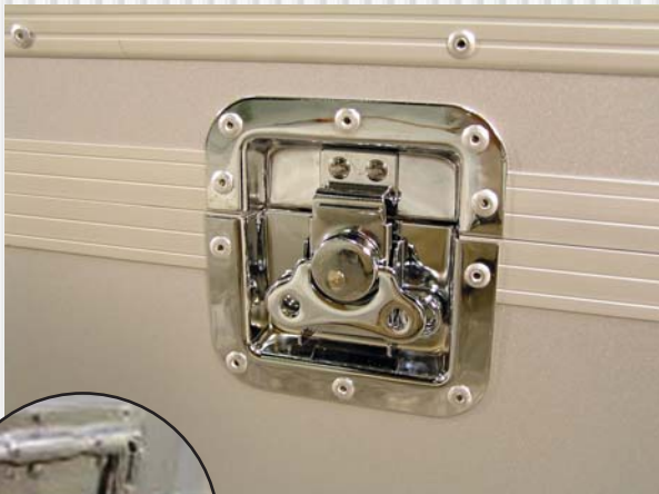
Locking mechanism on the metal storage case ensures safety during the storage and shipping