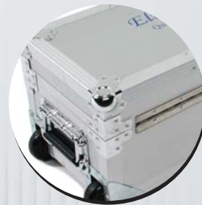
Strong Corner-Guard provides additional protection during transport and storage