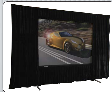
QuickStand Folding Screen 100" (Q100VD) shown with Standard Drape Kit