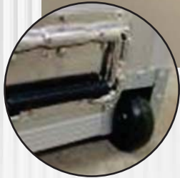
Light weight and durable aluminum traveling case is wheeled for easy transport, storage and shipping