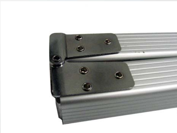
Aluminum frame connections ensure structural integrity with constant use.