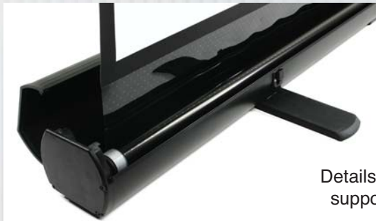
Details of the telescope bracket hook support and variable height setting

ezCinema Series , Screens pull up from case and attach to an adjustable telescoping bar with variable height settings with a keystone adjustor. Solid rotating floor supports provide added stability.